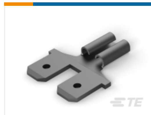
TE Part # 63699-1 ADAPTER 187 FASTON TPBR