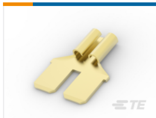
TE Part # 61765-1 FASTON ADAPTER .250 RECEPTACLE BR